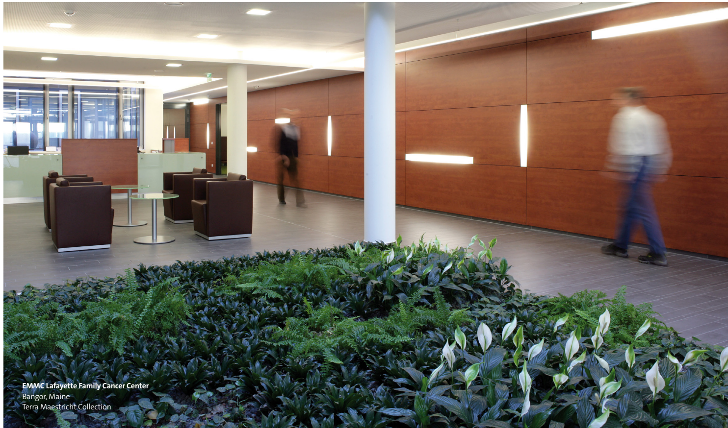
EMMC Lafayette Family Cancer Center Bangor, Maine Terra Maestricht Collection