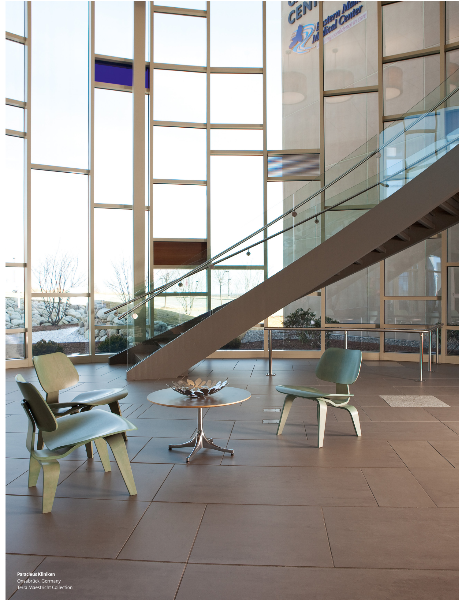
Paracelus Kliniken Onsabrück, Germany Terra Maestricht Collection