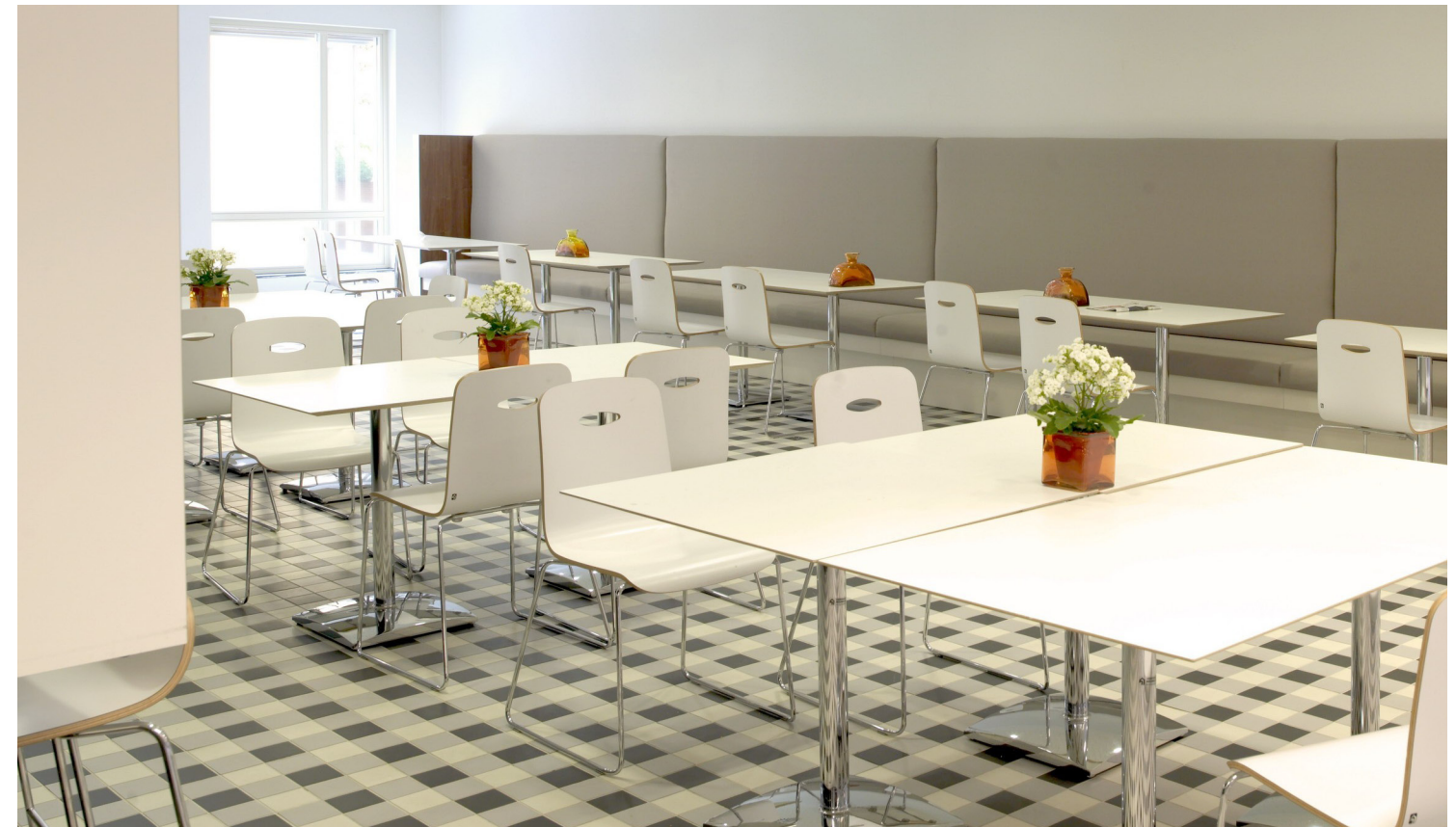
Kennemer Gasthuis Haarlem, the Netherlands Global Collection

With Mosa, you can take a rich excursion into design while using materials that hold up in these environments. With hundreds of colors and myriad sizes in wall tile, and Mosa's online pattern generator, the design possibilities are endless. Floor tiles also provide a beautiful, immersive foundation for your design that feels organic and appears ever-changing. Our experts can help you create health-care environments that make the journey to wellness a bit less challenging.