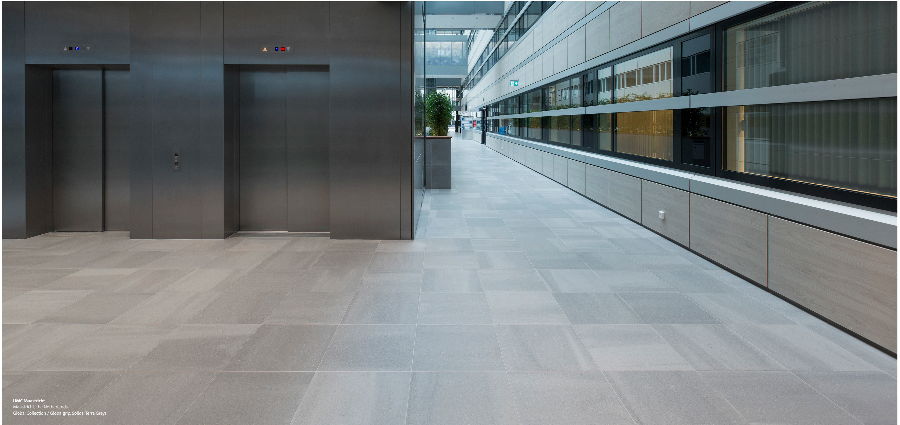
UMC Maastricht Maastricht, the Netherlands Global Collection / Globalgrip, Solids, Terra Greys