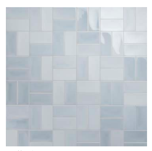
0604 blue mist