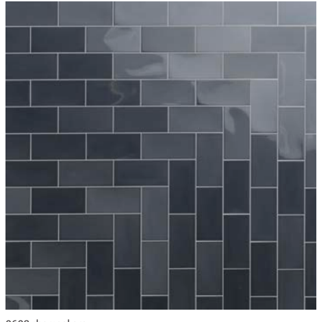
0608 charcoal grey