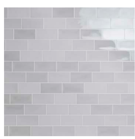
0605 fog gre