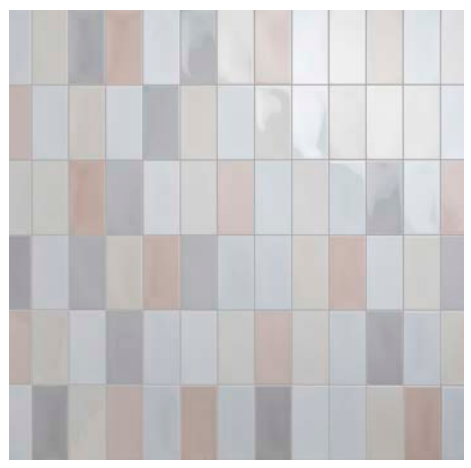
Mix 0601 serene white / 0602 blush / 0605 fog grey / 0606 bone