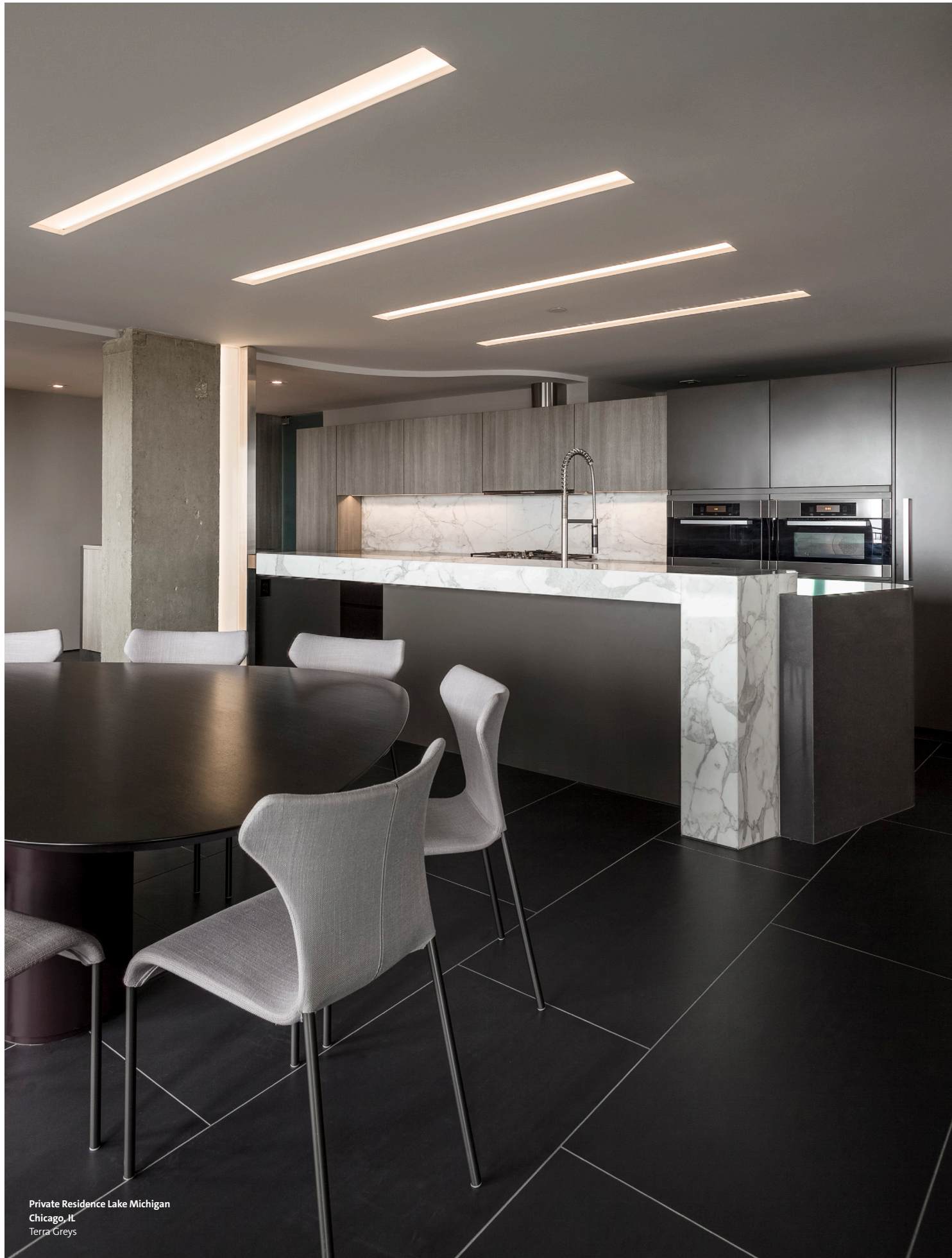
Private Residence Lake Michigan Chicago, IL Terra Greys