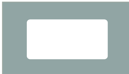
4 | Finished cutout with rounded corners