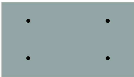
1 | Mark corners

For square cut outs for sinks and cooktops proceed as follows: drill a hole (Ø 30 mm - 1-¼") at the four corners of the square, then cut with a blade the lines between the holes, in a way that leaves the corners rounded (see FIGURE 1 ). Please note: whenever fabricating the cutout for the cooktop, make sure the heating element is placed more than 20 mm (3/4") from the edge of the cutout. This is to avoid potential cracks due to excessive heating.