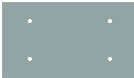
2 | Drill holes where marked