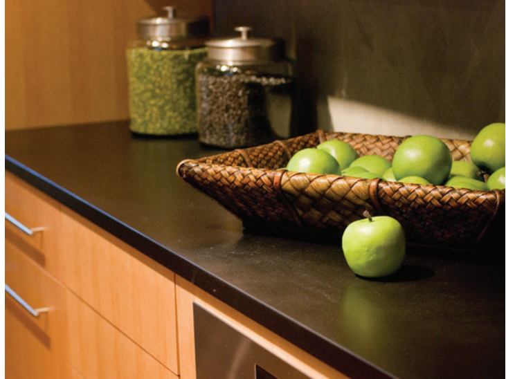
See the PaperStone® Finish Guide for more information on finish choices and application techniques.